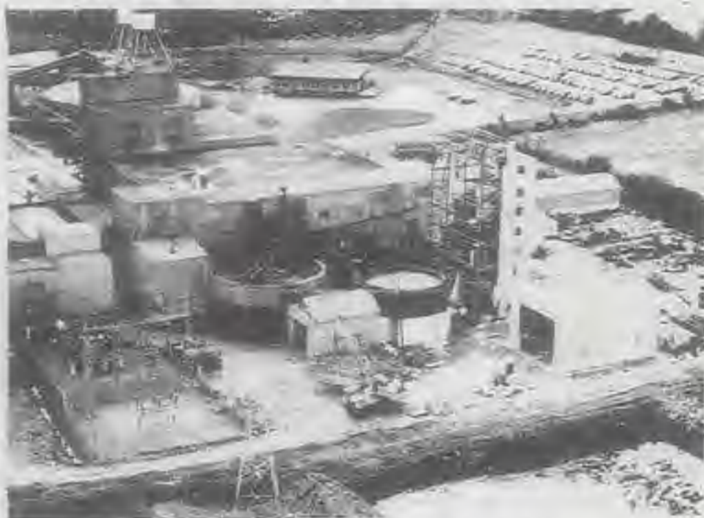
The Tynagh complex.